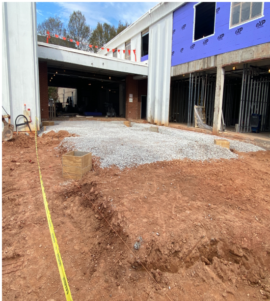
Began Forming up slab for new addition next week