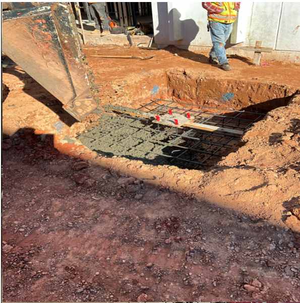
Column footings for the new addition have been poured