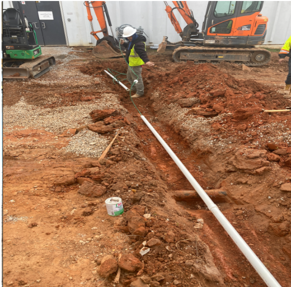
Continue to install underground site plumbing