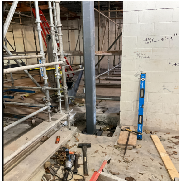
Continue with structural steel install in area 2