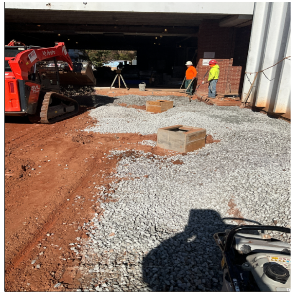
Prepping new addition for slab pour