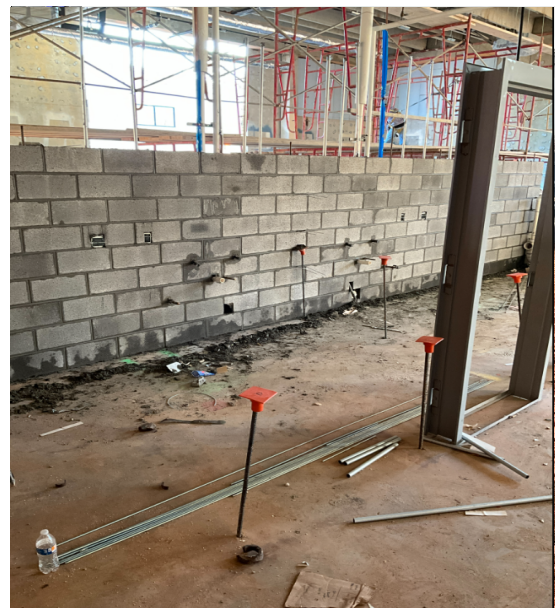
Continue to construct CMU block walls in the cafeteria